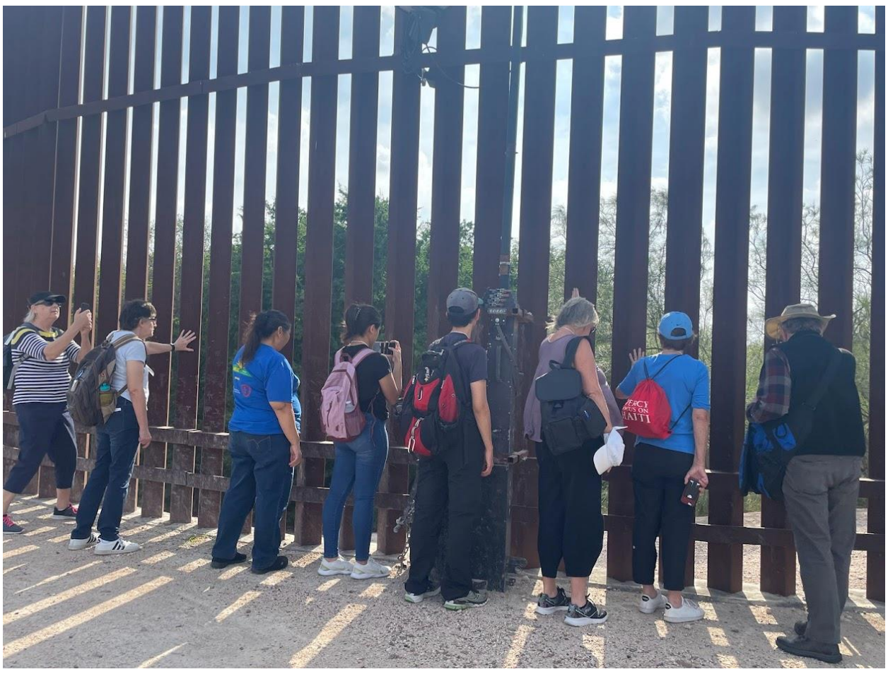
Participants in an immersion experience to the Rio Grande Valley in Texas visit the border wall.

The Justice Team had 28 people participate in immersion experiences on the U.S.-Mexico border to explore the root causes of migration, including climate change, extreme weather and displacement by climate change.