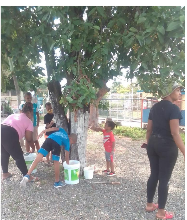
Students and staff clean up the grounds at Alpha Infant School in Jamaica.

In September, to celebrate its five-year anniversary, Mercy Education encouraged schools to include service activities as part of their celebration of Mercy Day. Inspired by the Sisters of Mercy Critical Concerns, many schools chose to focus on care for Earth. which included picking up trash, participating in compost programs, sowing seeds for sustainability, participating in a Cosmic Walk to meditate on the gift of God's creation and beautifying school property. Mercy Education staff participated in the five-year anniversary service extravaganza by volunteering with the horticultural therapy program at Holy Angels in