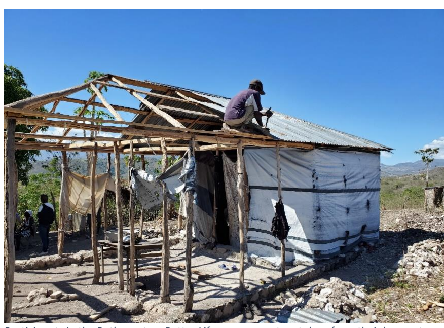
Participants in the Pathway to a Better Life program get metal roofs on their homes to protect them from the rain.

Mercy Focus on Haiti provided funding support and occupational training to 150 families in the Gros Morne region of Haiti.