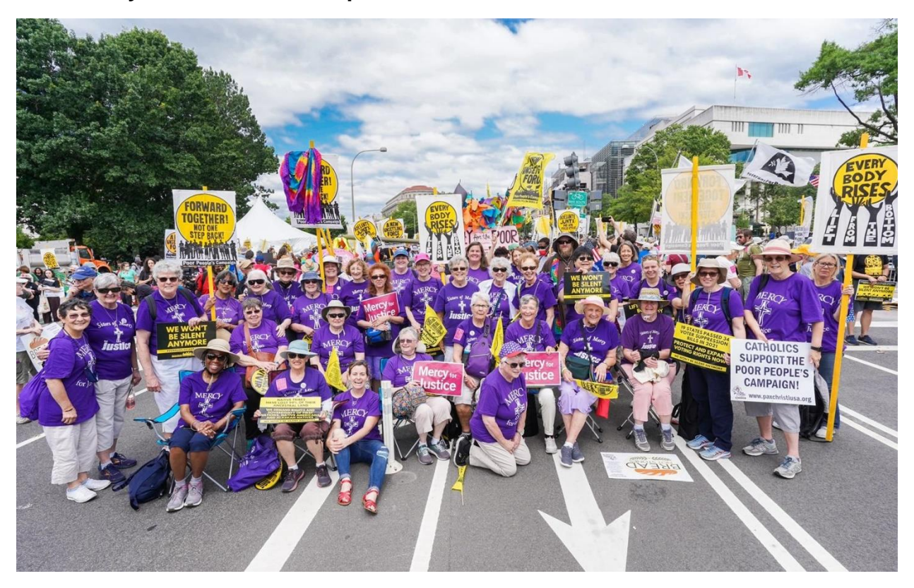
Mercy sisters, associates, co-workers and friends participated in the Poor People's Campaign mass mobilization in Washington, D.C., in June calling for policies to support low-wealth Americans.