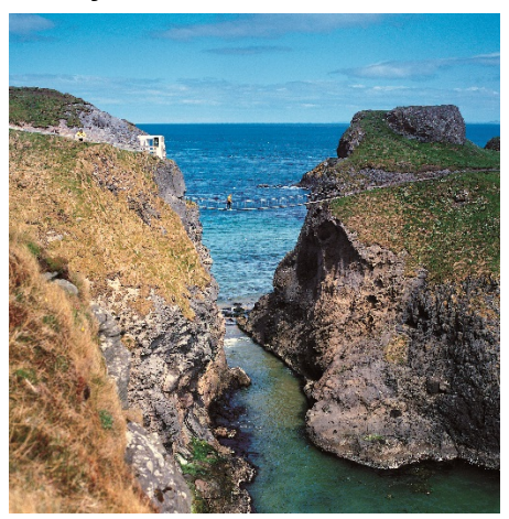
Day 8: Thursday, September 15

This will be a busy day and we might have to amend depending on duration required at each of the visits.